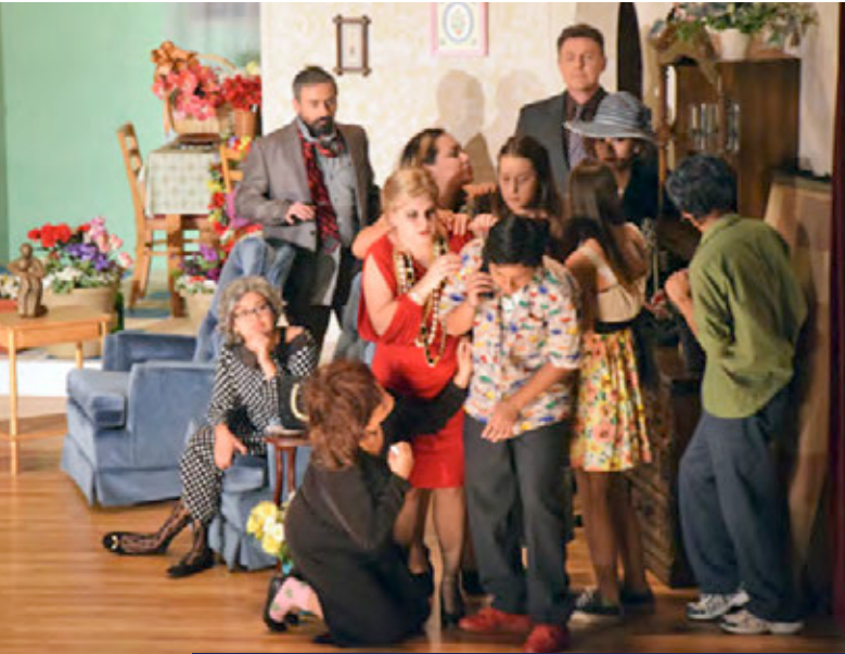
Oklahoma Panhandle State University's Department of Communications presented a drama production, Waiting for the Hearse , on campus this November.