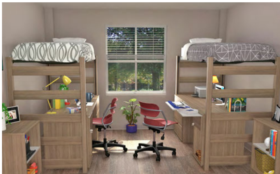
Image of future room design plans at Holter Hall