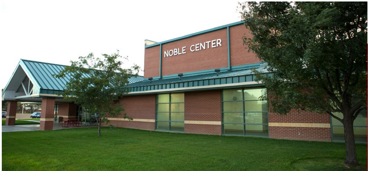
The Noble Center opened in 2003. With 52,000 square feet, the Noble Center provides many opportunities for fitness, fun, studying and socializing.