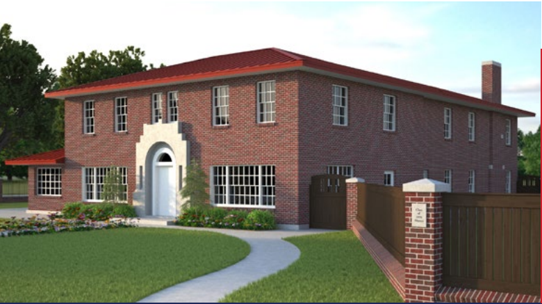
The University House is estimated to be complete this summer.