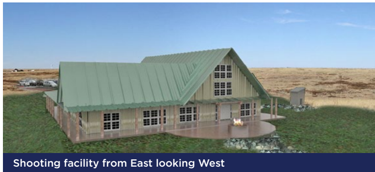
Shooting facility from East looking West