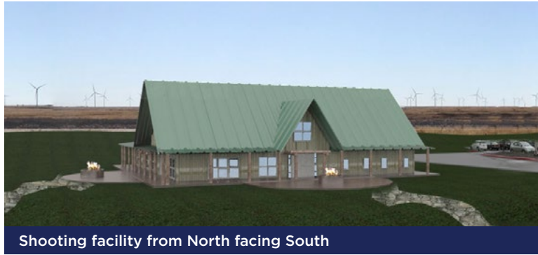
Shooting facility from North facing South