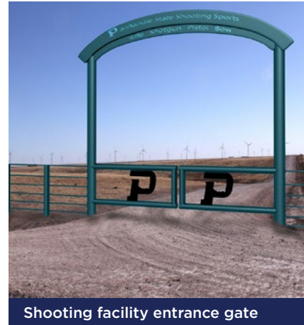
Shooting facility entrance gate