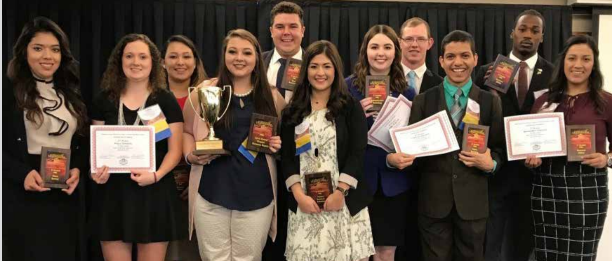
Panhandle State PBL had ten students qualify for nationals at the recent State Leadership Conference.