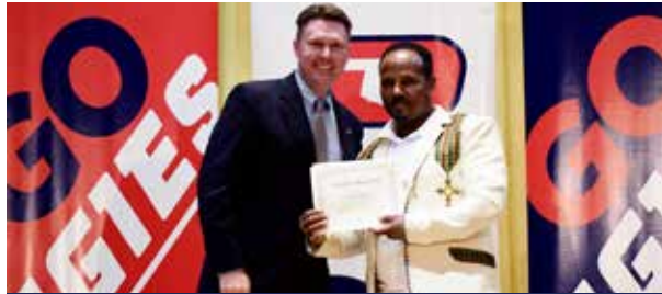
The Student Government Association (SGA) hosted the annual Honors Ceremony and Reception on April 18, 2017 in Hughes Strong Auditorium.