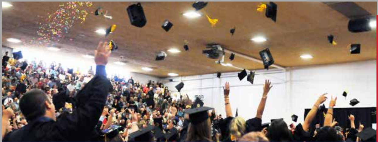
Students were allowed to decorate their mortar boards and enter them in a contest for the first time at this year's graduation ceremony.

G raduates got the opportunity to show their Aggie Pride off on their mortarboards during the 2017 Commencement Ceremony. All graduating seniors were invited to enter their cap in the first annual decorating contest. Judging took place during commencement rehearsal. A winner was selected among the entries submitted within respective schools. Each winner received a beautiful diploma frame. P