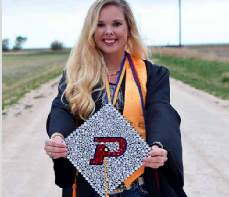
Over two-hundred graduates celebrated the end of a chapter as they walked the stage at commencement on Saturday, May 20.