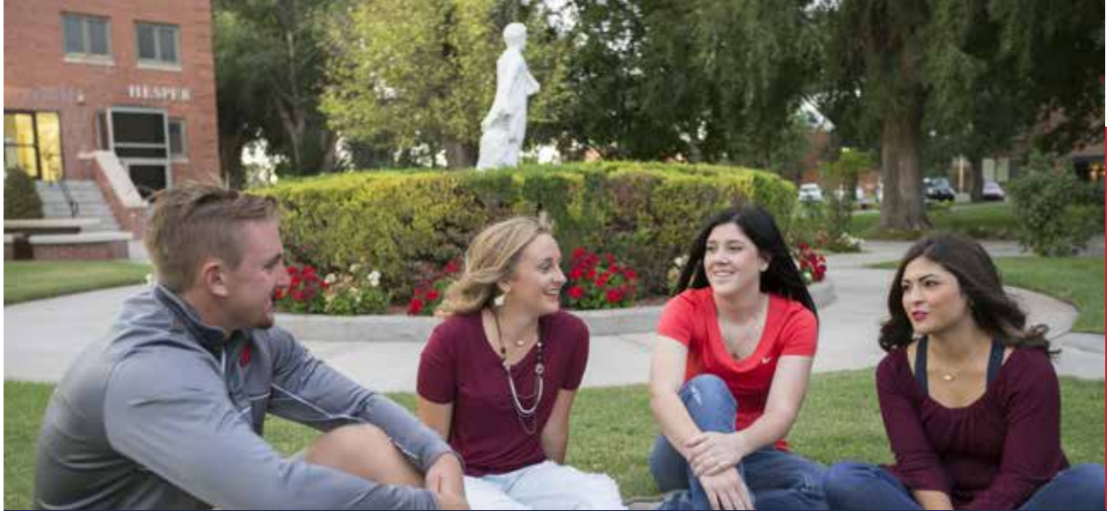
The Sower statue has stood as the focal point of campus since its debut in 1915, welcoming decades of students and visitors to Oklahoma Panhandle State University.