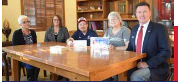
Foundation and Alumni officials show off the new license plate design.

Panhandle State Foundation is a 501(c)3 charitable organization created in 1961 with the sole mission of supporting Oklahoma Panhandle State University