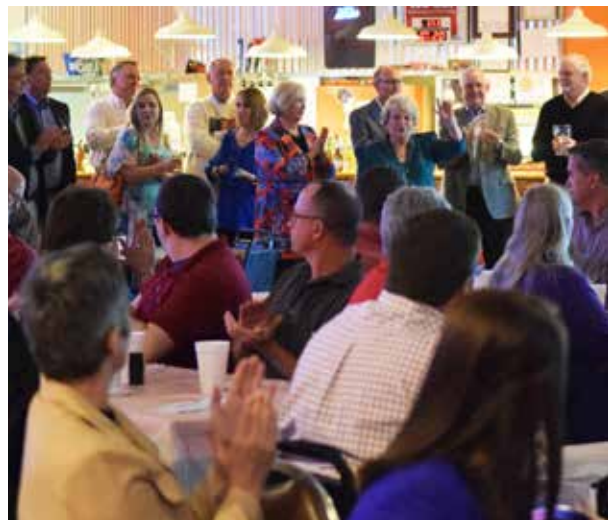
Faculty, staff and students enjoyed gathering with the Oklahoma A&M Board of Regents for a Panhandle Family reception.