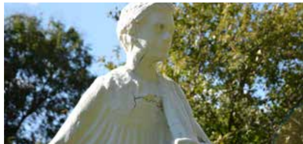
Artist Frank Ingels created the piece as a gift.

Few statues stand so diligently in as beautiful of a landscape like The Sowers ambience. This statue is a true compliment to what OPSU and the Oklahoma Panhandle symbolize. The Sower is a true illustration of peace and calmness from the hectic college experience. P