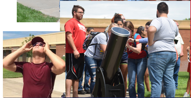
People across campus turned out to get a glimpse of the Solar Eclipse on Aug. 21.