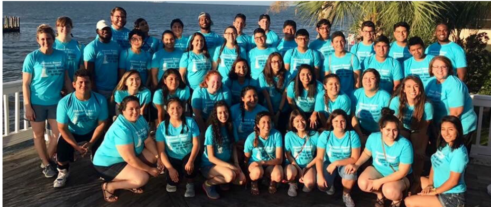
The Upward Bound group pauses for a quick photo at Lighthouse Buffet at Kemah Boardwalk during their educational trip that wrapped up a six-week summer camp.

Special thanks to all the instructors who helped make the camp possible: