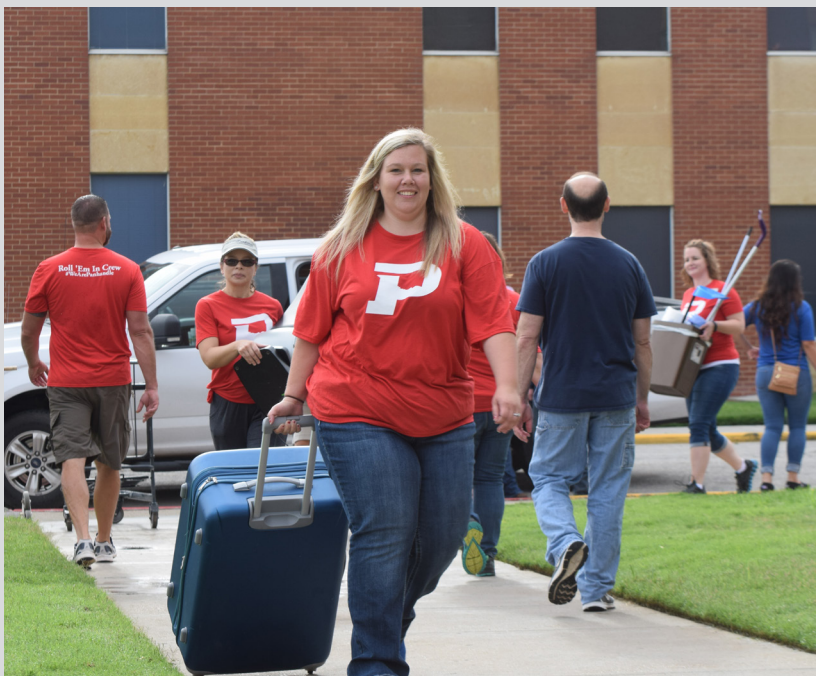
Faculty and staff greeted new and returning students with smiling faces and helping hands on Move-in Day.