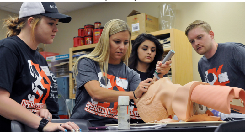
Area high school students get hands-on instruction from OSU medical students during Operation Orange hosted at Panhandle State.

Special thanks to the Oklahoma State University-College of Health Sciences for putting the program on and to the Oklahoma State College of Osteopathic Medicine for providing lunch. P