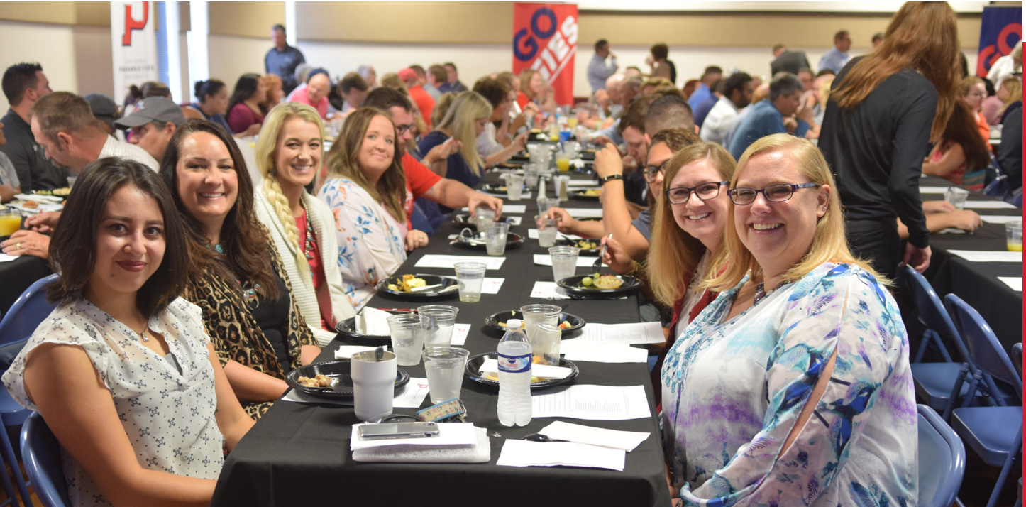
It's smiles all around at the Back-to-School breakfast.