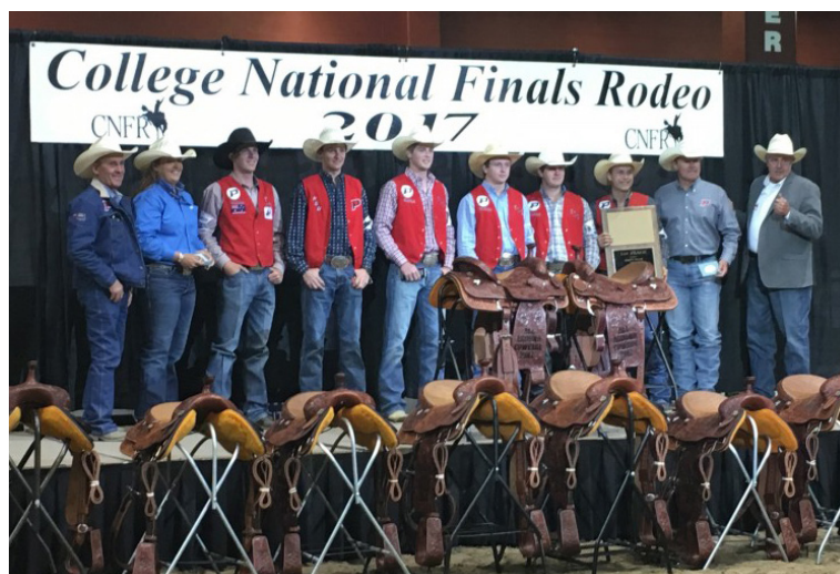
It was a team effort all week long at the 2017 College National Finals Rodeo (CNFR) for the Panhandle State Men's Rodeo team as they secured their sixth national title.