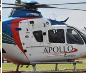
Local Police and Fire departments took part in the Guns N' Hoses event prior to an Aggies Football game. Apollo Med Flight delivered the game ball for the special First Responders Appreciation Day.