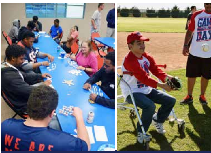
Aggie Football Families Potluck. Right: Baseball Special Game

Community outreach continues to build among all areas of Aggie Athletics as teams reach out to include local groups, businesses and alumni in family-friendly events and game-day activities. P