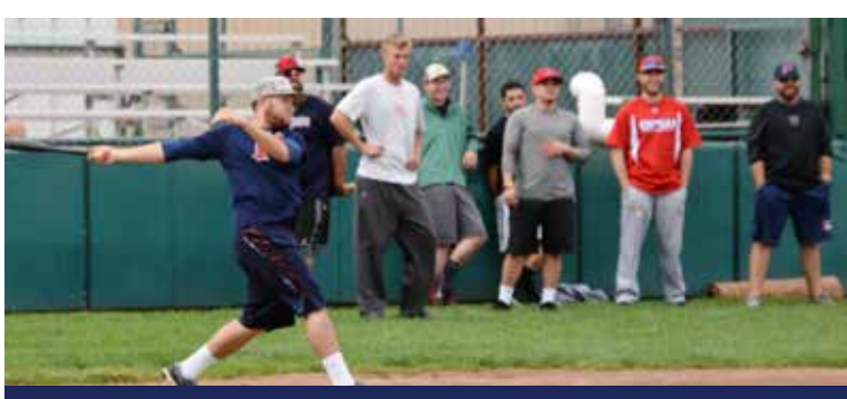
Aggie Baseball hosted an Alumni Homerun Derby and Dinner.