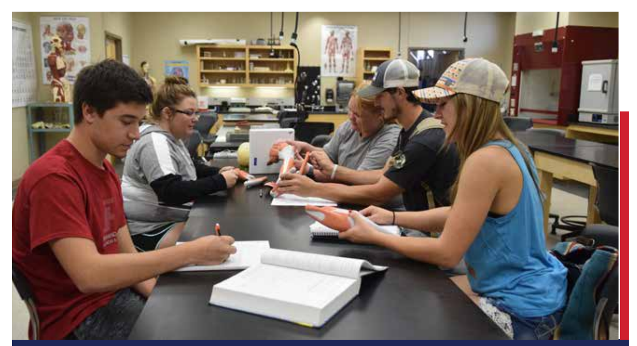
Students are shown taking notes and studying together. Panhandle State saw a 38% increase in this year's freshman class, making it the largest freshman class in university history.