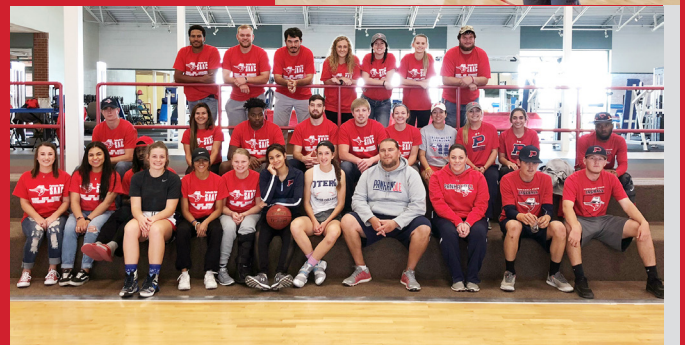
SAAC members gather with participants at the first annual Tri-Aggie-Thon.