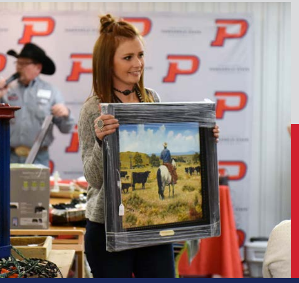
The Panhandle State Rodeo Team saw great support once again at the Annual Top Hand Auction.