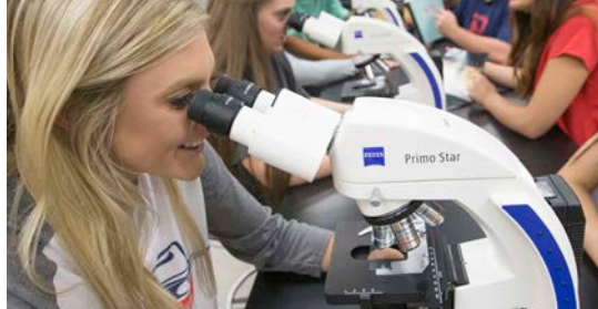
Panhandle State has once again recorded the largest freshman class and enrollment is up across the board.