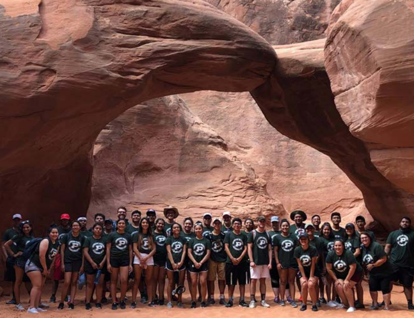
Campus saw over 60 high school students this summer for Upward Bound Camp.