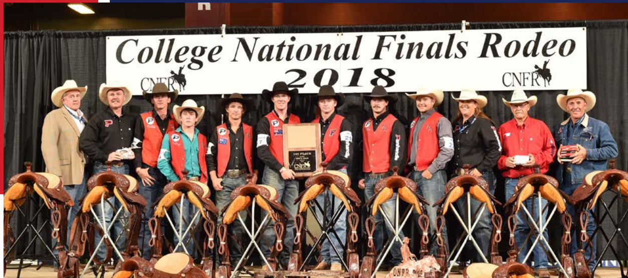
The Panhandle State Men's Rodeo team secured the University's second consecutive set of National Titles on Saturday night, June 16th at the CNFR in Casper, Wyo. This championship took the University's tally to seven with previous titles in 1997, 1998, 2000, 2004, 2013, 2017, and now 2018.

was 79 points in the bareback riding to start the night, I knew the boys were going to handle it."