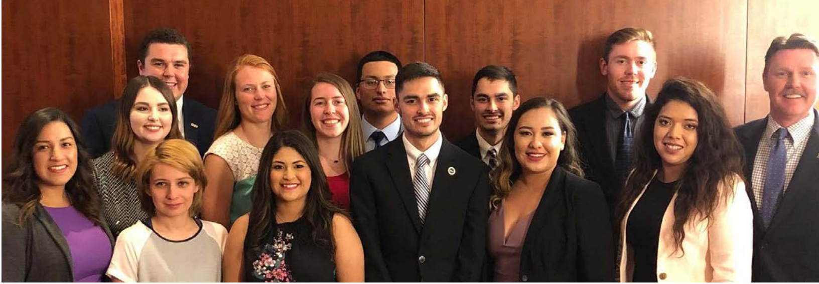
PBL members traveled to National Leadership Conference this summer in Baltimore.