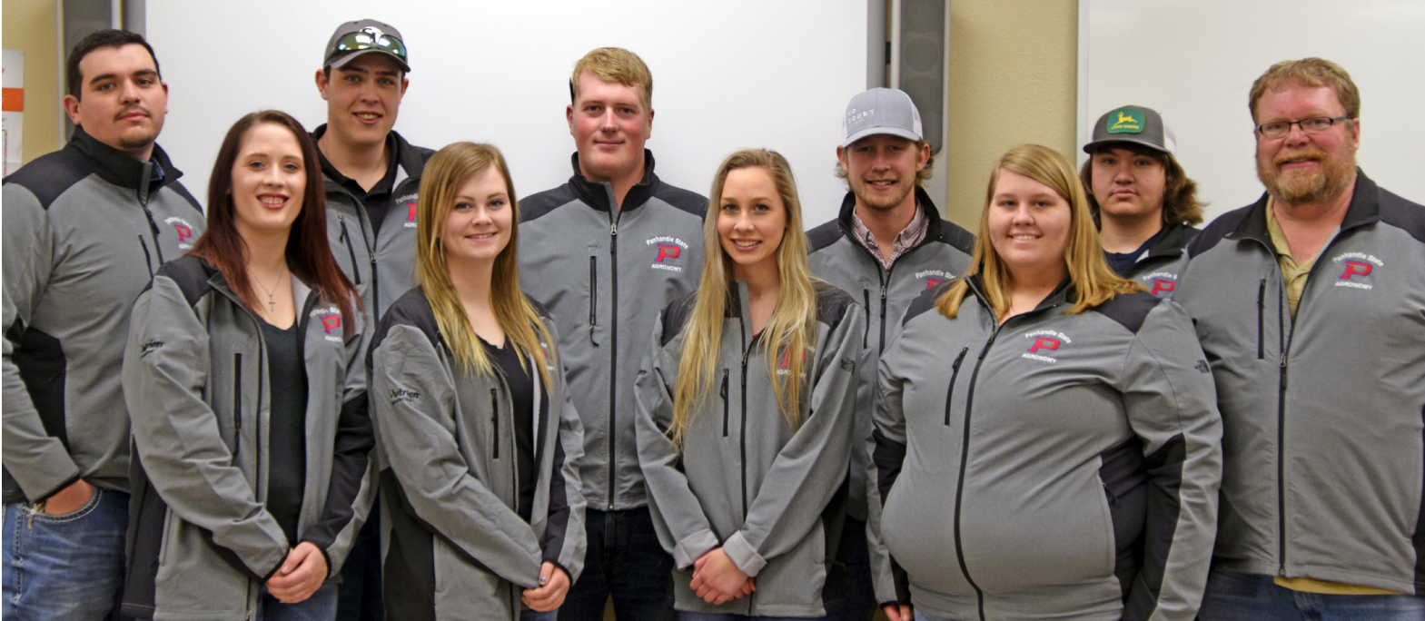
The Panhandle State Crops Judging team placed fourth at a recent contest in Curtis, Neb.