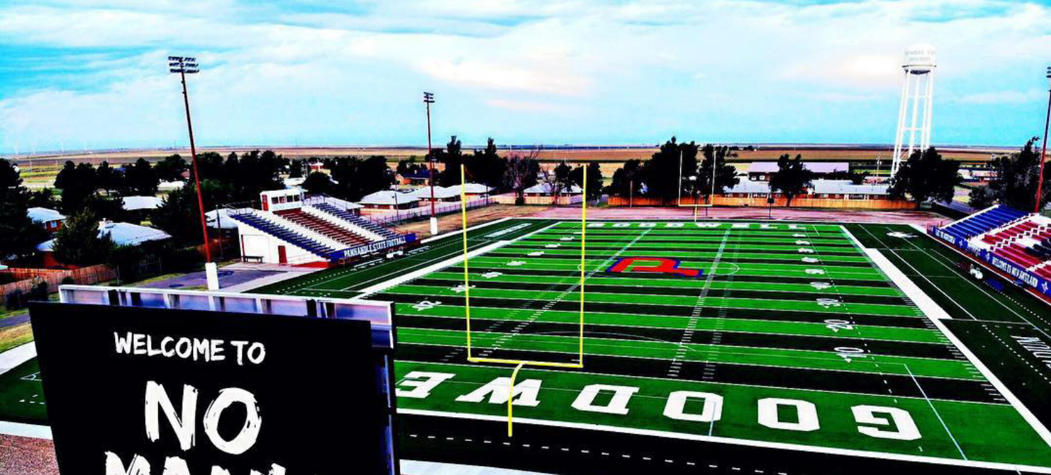
Anchor D Stadium will see the addition of men's and women's soccer in the fall of 2019.