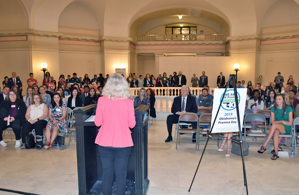
Oklahoma Promise Day was April 9, 2019.