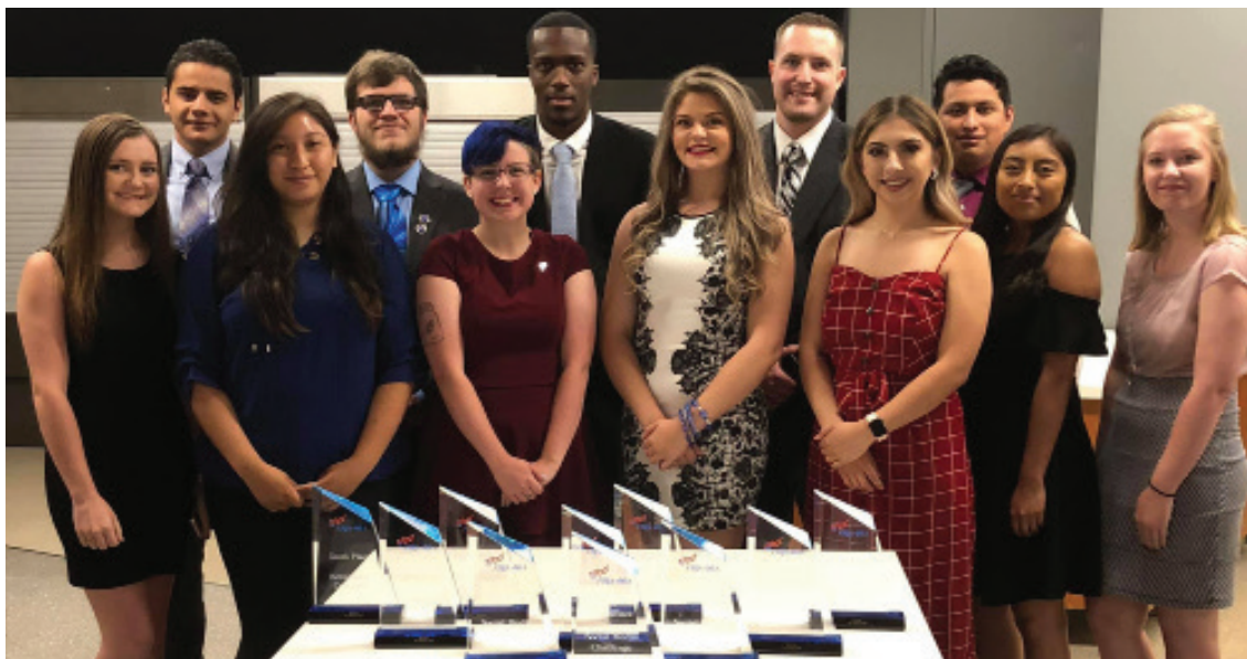
The 2019 Future Business Leaders of America-Phi Beta Lambda (PBL) Team.