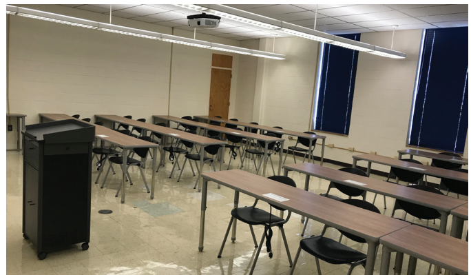
Before (left) and after (right) of the newly refurbished classroom furniture in Hamilton Hall.