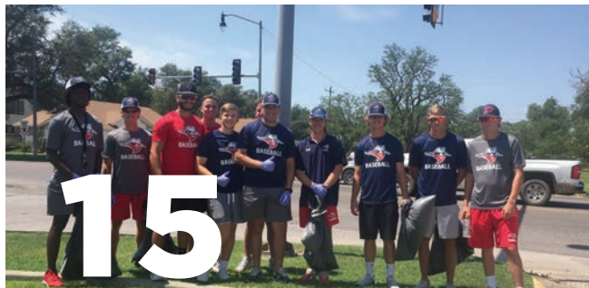
On the cover: Honor Grad Box