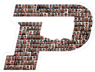
Polly Alldredge Nursing