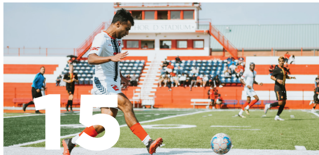
On the cover: Student - Panhandle State Students