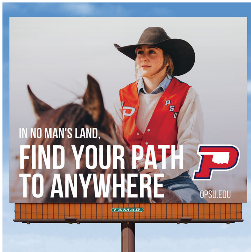
Billboard Series, "In No Man's Land, Find your Path to Anywhere"

Website Design: OPSU's website was redesigned and launched in March 2023 with a new look and feel. This new website is modern, easy